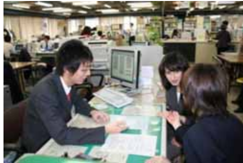
Volunteer Interpreter Activity