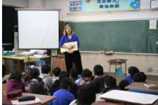
Educational Program for International Understanding