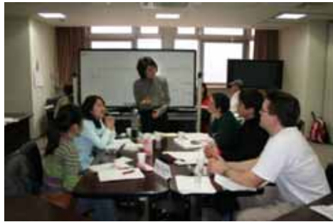
Introductory Japanese course