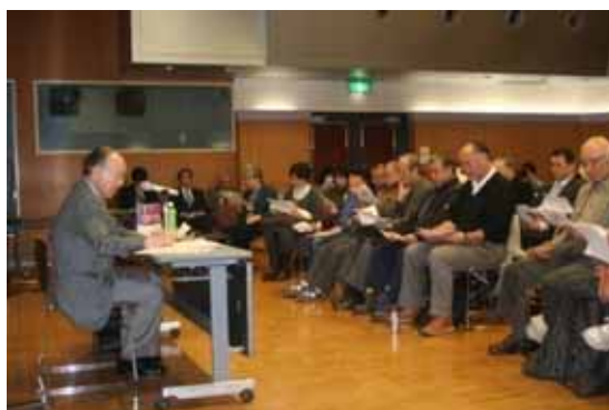
Lectures for International Understanding