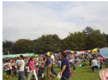
MISHOP WORLD - Mitaka International Exchange Festival