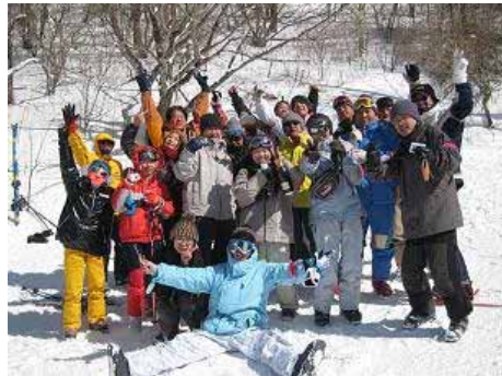
MISHOP International Exchange Ski Tour