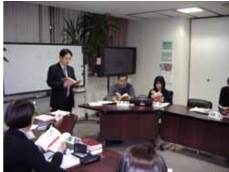
Introductory Chinese Course